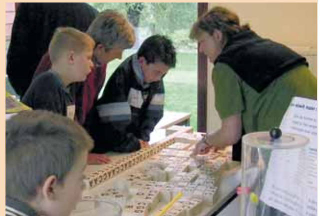
The Mycomuncher DNA Puzzle in action. This photograph was taken at the 2004 science fair at the Netherlands Institute of Ecology (NIOO-KNAW), showing junior wannabe genome researchers solving the mycomuncher challenge

It was nice to see the students playing around with the wooden blocks. Their initial reaction when seeing the wooden pieces was that they were back in nursery school. When starting with the puzzle, however, they soon realised that it is not as easy as it appears, but that it takes a lot of work to decipher the DNA code and the function of genes.